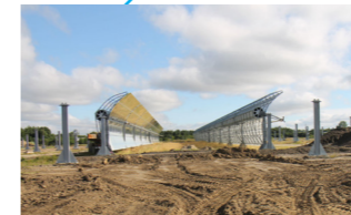
Winter 2016 Contract for 16.6MWth large-scale plant