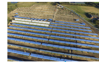
Spring 2016 Construction begins