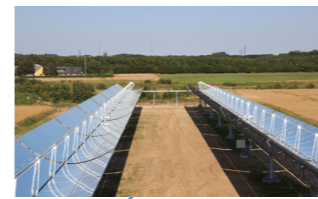
Summer 2015 0.8MWth test plant, performance monitoring