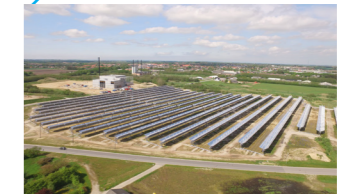
Winter 2016 CSP plant goes operational